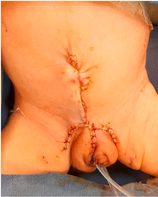
Fig. 3. Final aspect.