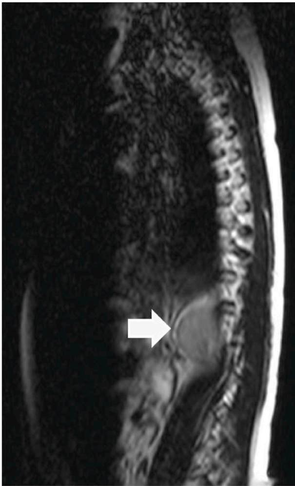
Fig. 1. MRI showing a formation extending into the spinal cord (arrow), from T12 to L2, measuring 3,8 cm in longitudinal length and axial thickness of 1,8 cm.

The lesion was excised after the entire arachnoid, that was too thick, had been detached. A microscopic examination of a fragment that had been frozen during the intervention, revealed it, actually, to be an inflammatory process rather than a tumor. The definitive anatomopathological examination of the surgical specimen showed a granulomatous inflammatory process typical of Schistosoma mansoni infections (Fig. 2). He was treated on Praziquantel, on a 60 mg/Kg single dose. Thorough anamnesis revealed that the child had been swimming a few months earlier in a place suspected of existence of the worms. Following the intervention